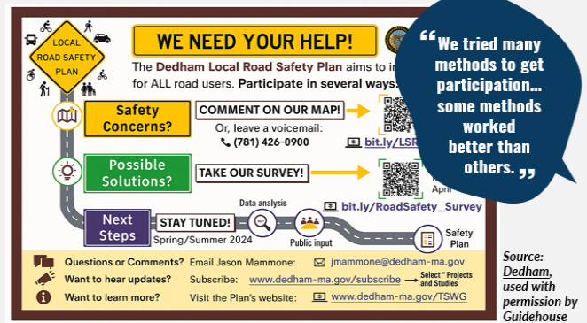
Dedham's postcard that was distributed throughout town.